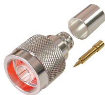
RFN-1006-3I ●● Crimp, Silver Plated