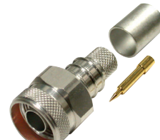
RFN-1006-I-WB ●● Crimp, White Bronze Plated