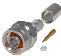
RFN-1006-4I ●● Crimp, No Braid Trim White Bronze Plated