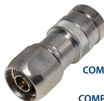
COMP-NM-400 ● N, Male