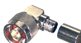
RFN-1009-I ●● Crimp, Right Angle White Bronze Plated 2-Piece (shown)