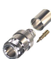
RP-1028-I ●● Reverse Polarity Crimp Nickel Plated