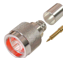
RFN-1006-3I2 ●● Crimp Silver Plated RFN-1006-I2 ●● Crimp Nickel Plated