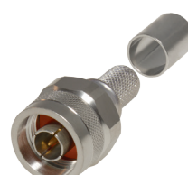
RFN-1006-49I ●● Quick Crimp White Bronze Plated