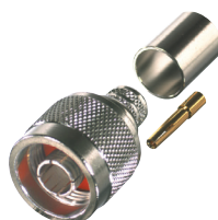
RP-1006-3I ●● Reverse Polarity Crimp Nickel Plated