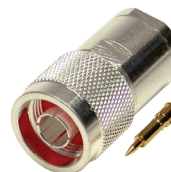
RFN-1002-1SI Solder Clamp Silver Plated