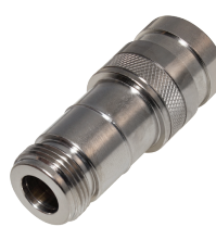
COMP-NF-400 ● N, Female