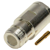
RFN-1024-1SI Solder Clamp Silver Plated