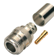
RFN-1028-SI2 ●● Crimp Silver Plated RFN-1028-I2 ●● Crimp Nickel Plated