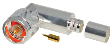
RFN-1009-3I ●● Crimp, Right Angle Silver Plated