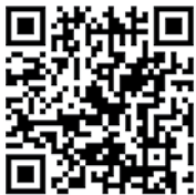
RadioMobile Fire Solutions