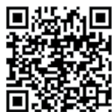
OptiFlex™ spec sheet