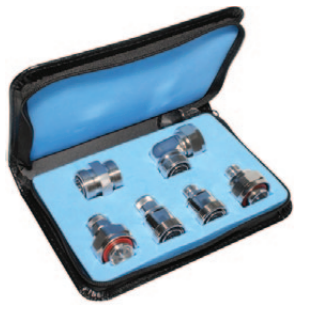
Available in a 6-piece kit containing the most popular 7-16 DIN and N adapters. P2RFA-4013-SŜ

TESTING FOR PASSIVE INTERMODULATION (PIM) of wireless base station sites generally includes the use of 7-16 DIN adapters. To assure accurate measurements, the adapters should be attached and tightened using a torque wrench. Traditional 7-16 DIN adapters are constructed of Silver plated machined brass bodies. Although they can be used for PIM testing, after multiple uses the interface surfaces will wear and the plating will begin to flake off, jeopardizing the accuracy of the testing.